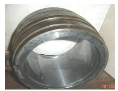
COUNTER SHAFT BEARING