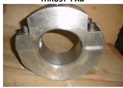
SO<sub>2</sub> BLOWER JOURNAL BEARING

Radhika Technologies Pvt. Ltd. (RTPL) is in no way endorsed by any original equipment manufacturer (OEM) identified in this website/E-Mail/Promotional material. All OEM names are trademarks or registered trademarks of each respective owners. All manufacturer's name, part numbers, symbols & description used in RTPL website/E-Mails/Promotional material are for cross reference & compatibility purpose only & it is not implied that any part listed is the product of these original equipment manufacturer's. GE/MJB/FLS/Thomassen/Burckhardt/Ingersoll Rand/Dresser Rand or any other original equipment manufacturer is a registered trademark. It is not the intent of RTPL Website/E-Mail/promotional material to mislead or confuse anyone to believe that is officially affiliated with any original equipment manufacture & Infringes upon the intellectual property rights of any original equipment manufacturer.