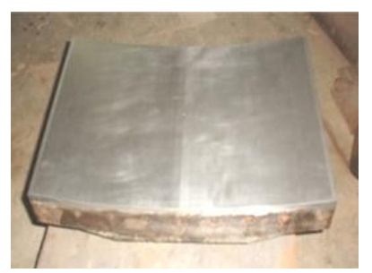
SLIDE SHOE BEARING