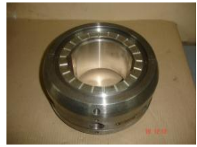
FAN BLOWER BEARING